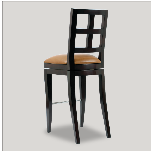
HIGH-BACK OPEN GRID: COM ¾ YD 18" W X 22" D X 42 ½" H