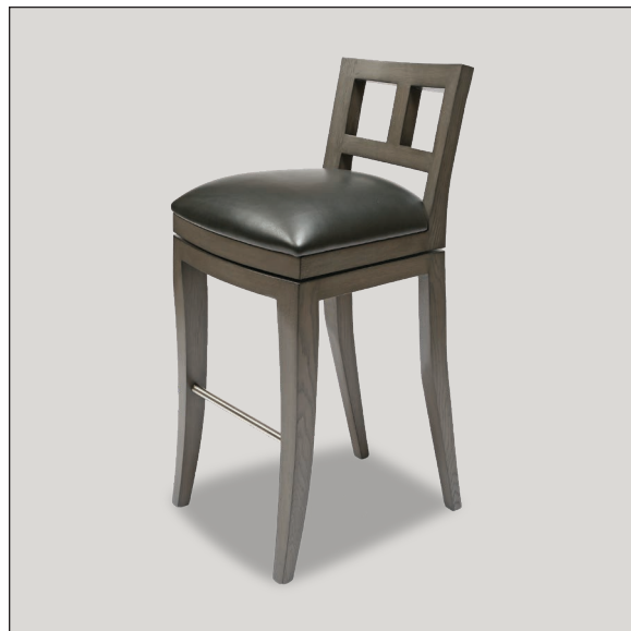
LOW-BACK OPEN GRID: COM ¾ YD 18" W X 22" D X 35 ½" H