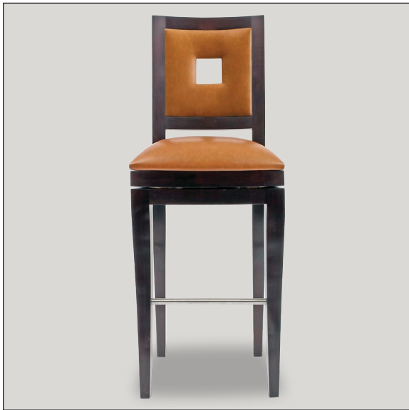
HIGH-BACK UPHOLSTERED: COM 1 ½ YD 18" W X 22" D X 42 ½" H