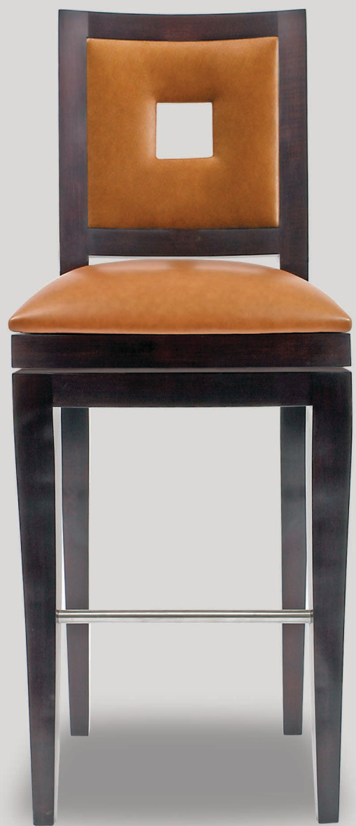
GRID SWIVEL BARSTOOLS