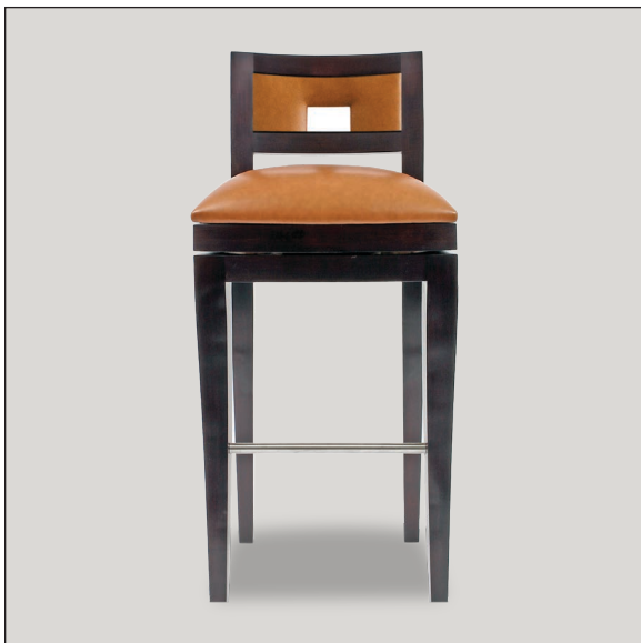
LOW-BACK UPHOLSTERED: COM 1 ½ YD 18" W X 22" D X 35 ½" H