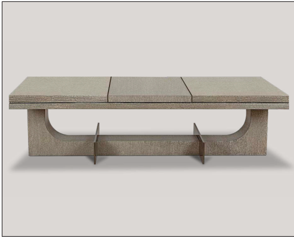
60" W X 28" D X 16½" H — SHOWN IN BR RIFT GREIGE CERUSED OAK WITH WOOD TOP . METAL INLAYS AND FINS IN BR PLATINUM POWDER-COATED FINISH