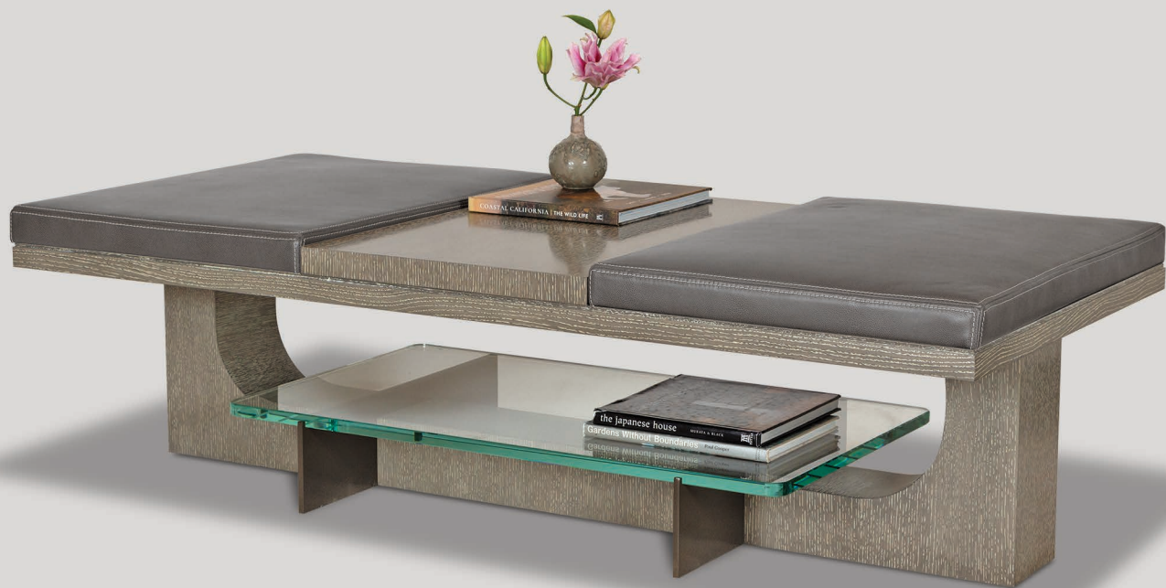
CRESCENT COFFEE TABLE