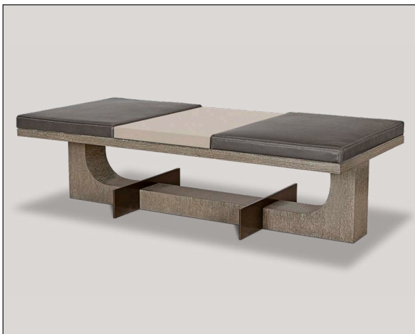
SHOWN WITH TWO CUSHIONS AND STONE CENTER INSERT. CUSHIONS IN BR COBBLED MOUSSE WITH NATURAL TOPSTITCH — COM: 3 YDS COL: 54 SQ FT