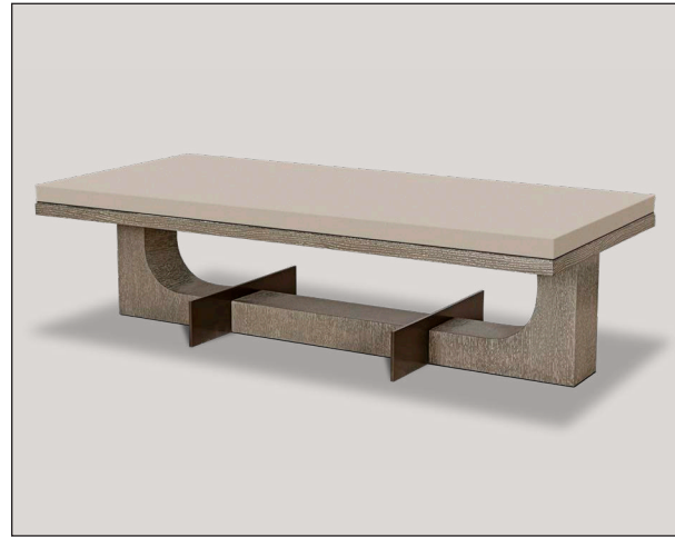
SHOWN WITH BR OATMEAL STONE TOP